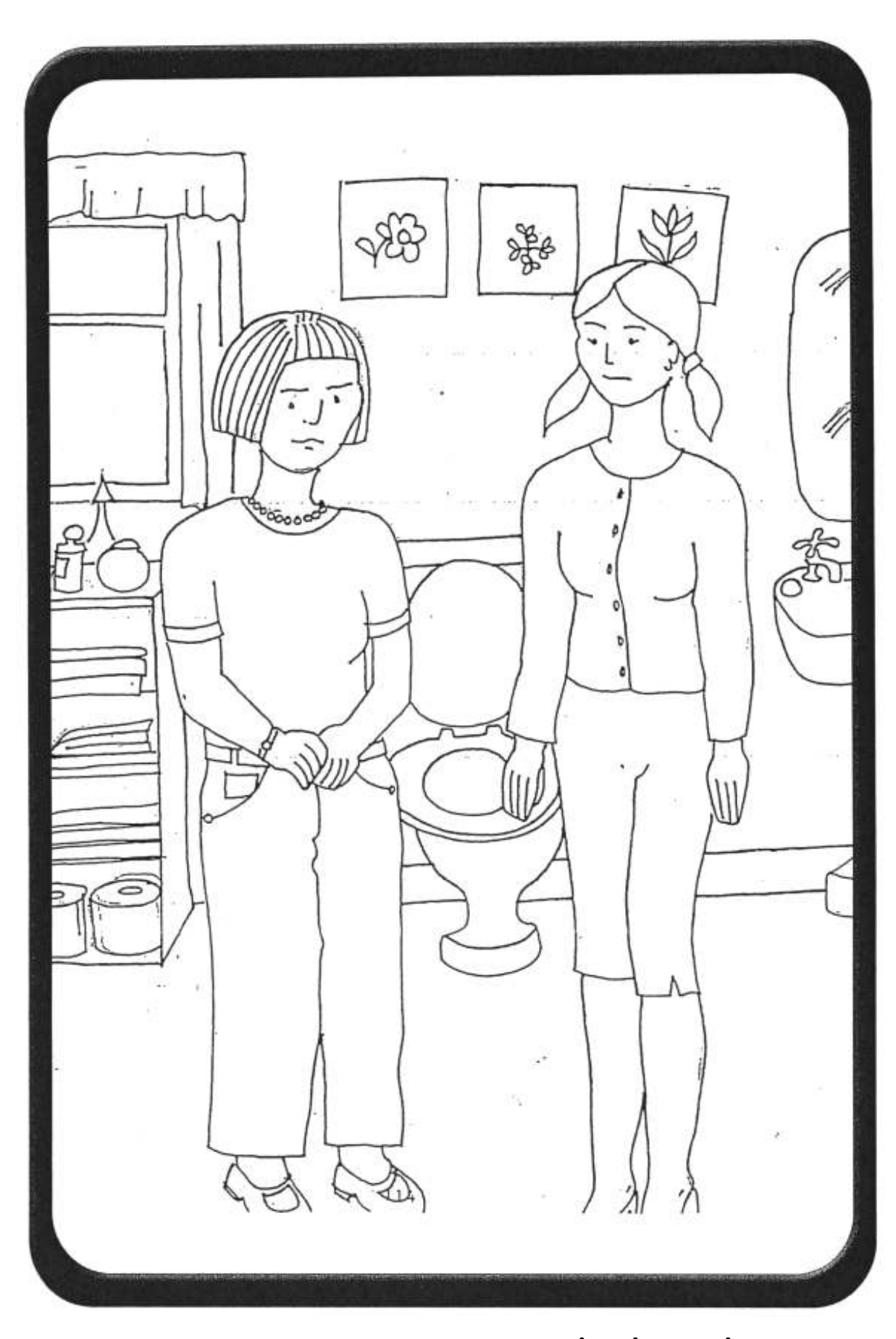
Sometimes we need a little help