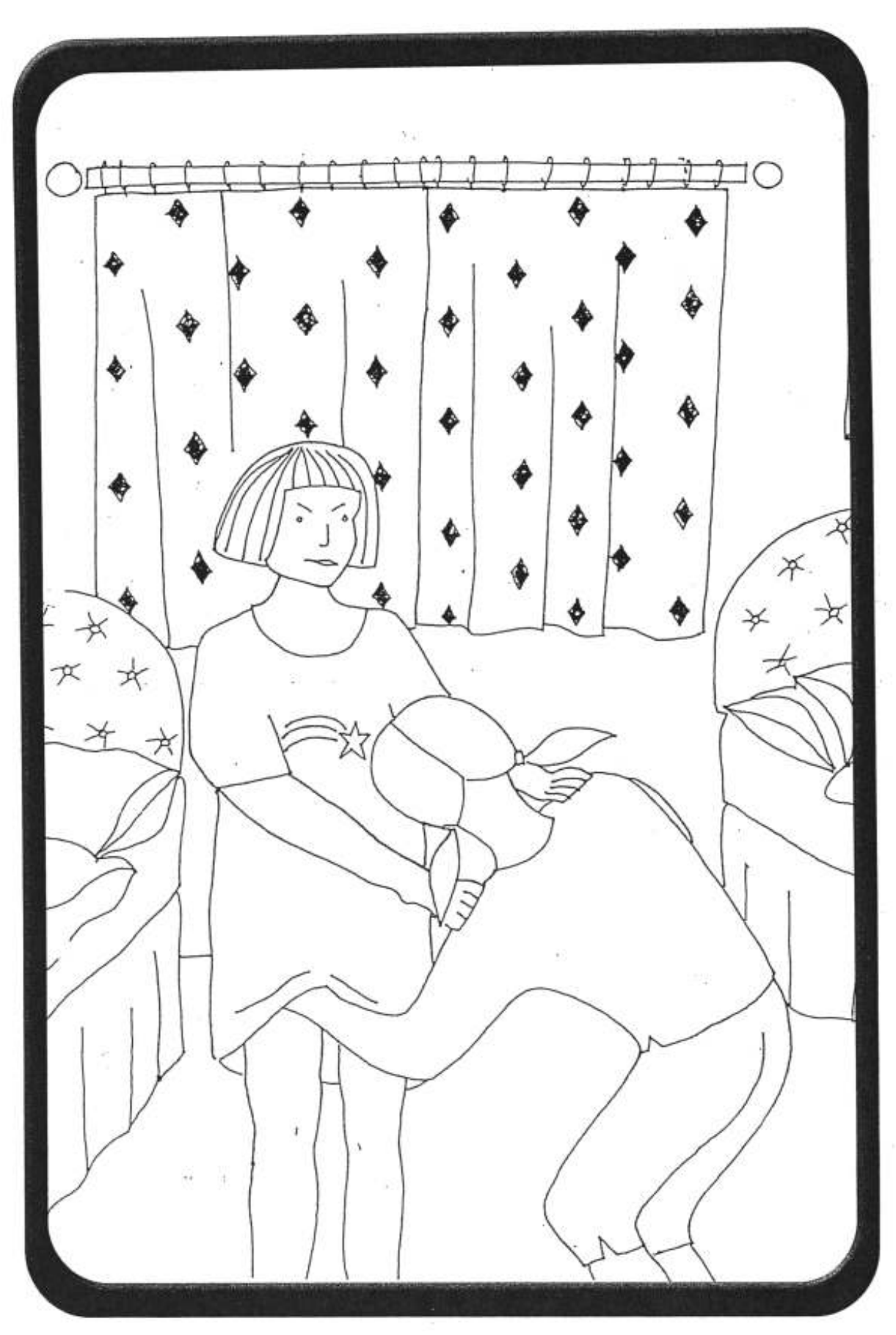
What should Mary do? What happened was not Mary's fault.